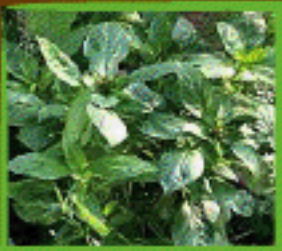
Mrs. Burns Lemon Basil