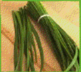
New Belt Garlic Chive