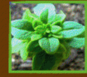
Spicy Bush Basil