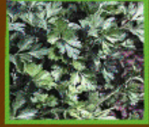
Giant of Italy Parsley