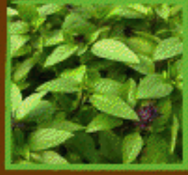
Sweet Thai Basil