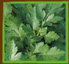
Titan Flat Parsley