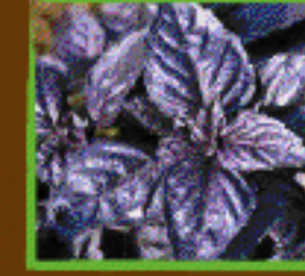
Purple Ruffles Basil