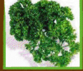
Forest Green Parsley